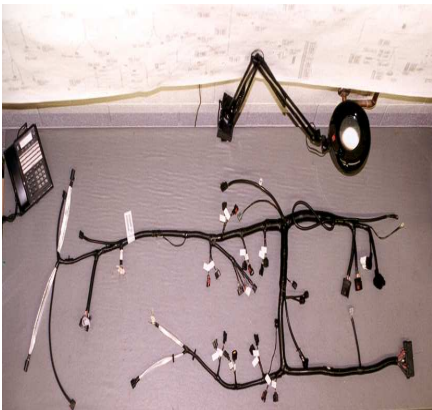
COMPLETED WIRE HARNESS