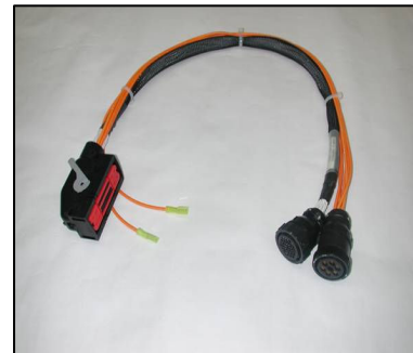
ABS Life Cycle Test Harness

In addition, we offer rework and other related wire harness support services. For further information about Miltech and our capabilities please call or Email us at: