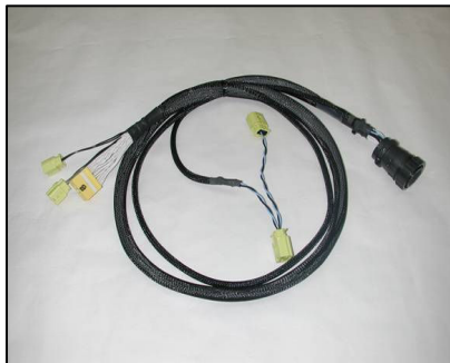
Air bag Validation Harness