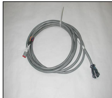
Mirror Switch Durability Harness